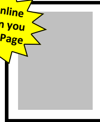
Full page ad