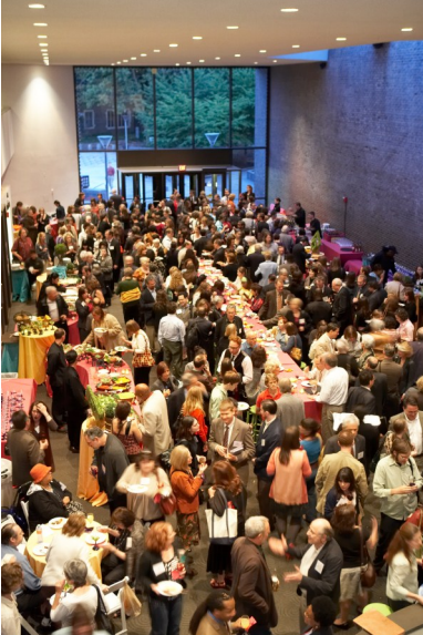
2009 Annual Member Meeting Reception

The Annual Member Meeting and Reception is the gathering of the season for those who work in and are affiliated with the arts and cultural sector. This year's meeting will be held on Monday, September 24 at the Annenberg Center for the Performing Arts.